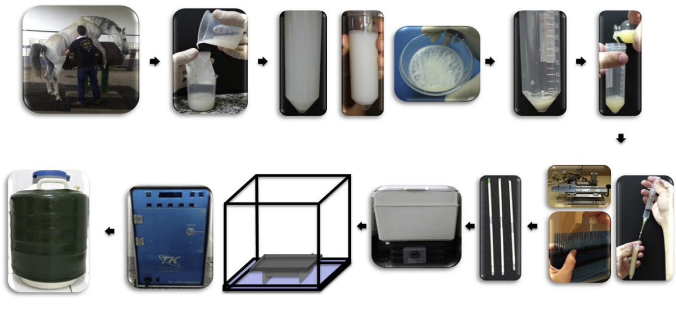
Figure 1. The procedures for freezing sperm. The semen is initially collected, filtered to remove gel, and then diluted with media extender prepared from skimmed milk. After seminal plasma has been removed, the sperm pellet is resuspended in freezing extender and frozen [21].